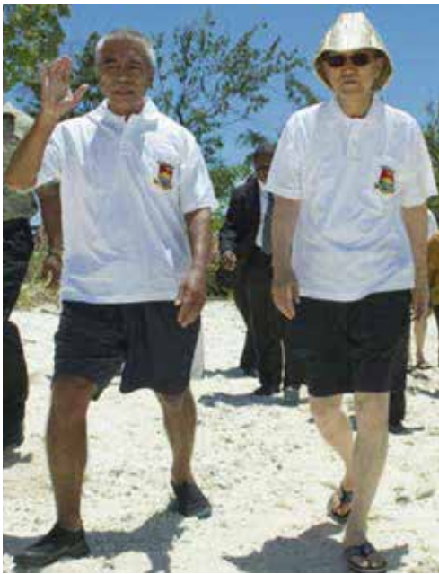
President Anote Tong (left) leads UN Sec-Gen Ban Ki-moon to a mangrove-seedling planting event to aid coastal protection during the Secretary General's Sept 2011 visit to Kiribati.

"At the launch of the International Year of Small Island Developing States, UN Secretary General Ban Ki-Moon stated: