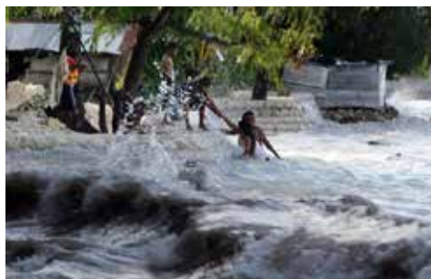
Sea rise – a fight for survival