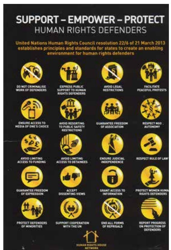
A postcard published by Eastern European Human Rights organisations highlighting HR issues.