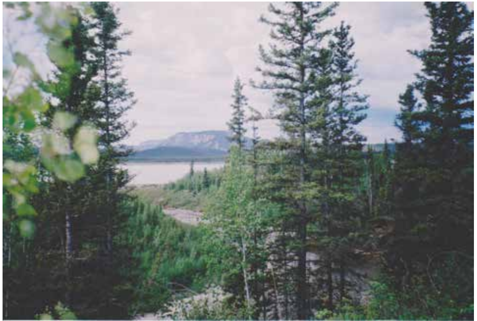
Remote wilderness surrounding Pehdzeh Ki (Wrigley) on the De Cho (Mackenzie River).

The tiny settlement of Pehdzeh Ki (Wrigley) of about 175 people on the De Cho (Mackenzie River) is home to a small Dene band whose language, cultural traditions and lands are seriously under threat, which is also the case of many other indigenous communities across Canada. The threats come from the activities of the petroleum, mining and logging industries and have led to more enforced assimilation policies by government. The fragile ecology of the north is experiencing devastating environmental changes which these policies have caused. This has become obvious over the last 40 years, particularly with the clear felling of the Rockies and the