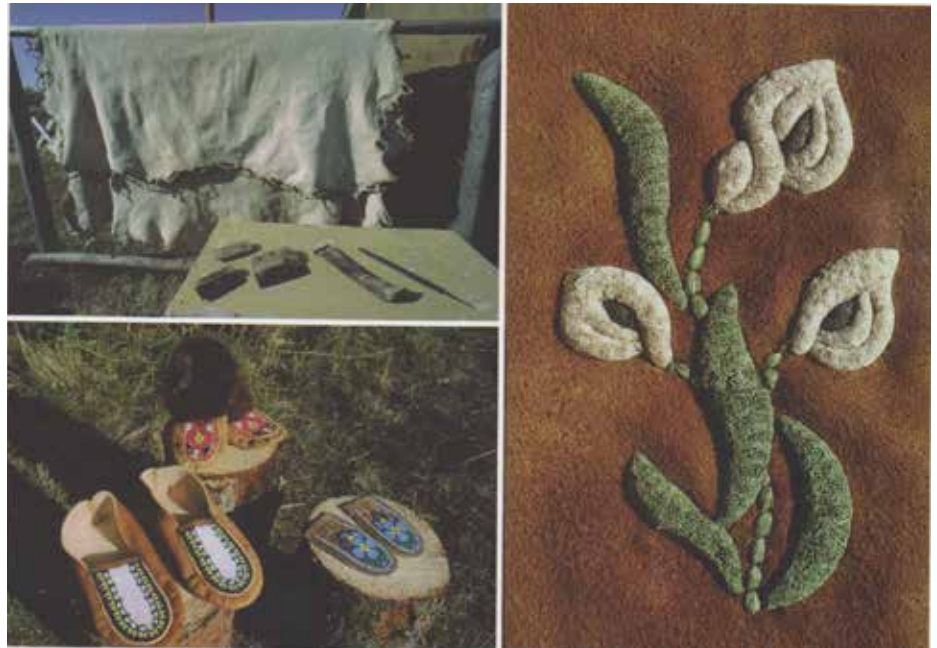
Dene craft work – hide preparation, moccasins with beadwork and an example of tufting done on moose hide.

Finally a film was shown to illustrate the struggle that First Nations communities have in preserving their culture in the face of mining and pipeline threats with the potential devastating impact on the environment. Tourism is much more sustainable and a longer term employer than mining and logging for example. Bev and Ron felt they were fortunate to have seen and worked in Canada in a period when the Rockies were still in a relatively pristine state and wild animals could be found outside National Parks.