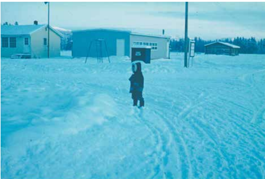
Pehdzeh Ki winter 1971 showing the school and community hall (log building).

Canadian First Nations have a wide variety of traditional cultures, housing and clothing and each group not only has different languages but different cultural practices similarly to the variety of countries in Europe. In Eastern Canada the Iroquois lived in log Long Houses and grew corn, in the Woodlands the various communities generally lived in wigwams. The Plains peoples lived in Tepees as they followed the buffalo and the West Coast people lived in communal log houses and were the peoples who had Totem Poles. Dress varied according to the region as did lifestyles. However, some values were held in common. For example the drum represents the heart beat of Mother Earth and the Eagle Feather is considered sacred and used in ceremonies. The drum style varies from hand held to large types for several drummers depending on the local region. The four sacred medicines are tobacco which is given to Mother Earth in thanks, sweet grass, cedar and sage. The Circle is regarded as sacred as it has no beginning and no end so all are equal. The Four Directions cover also the four seasons and the four periods of life. Ceremonies which are deeply sacred such as the Sun Dance and the Sweat Lodge are by invitation and un-